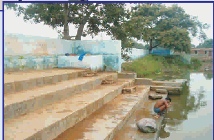
Construction of bathing steps and wall at village Ponds