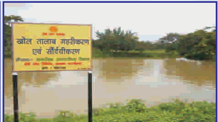
[Pond Deepening and restoration]