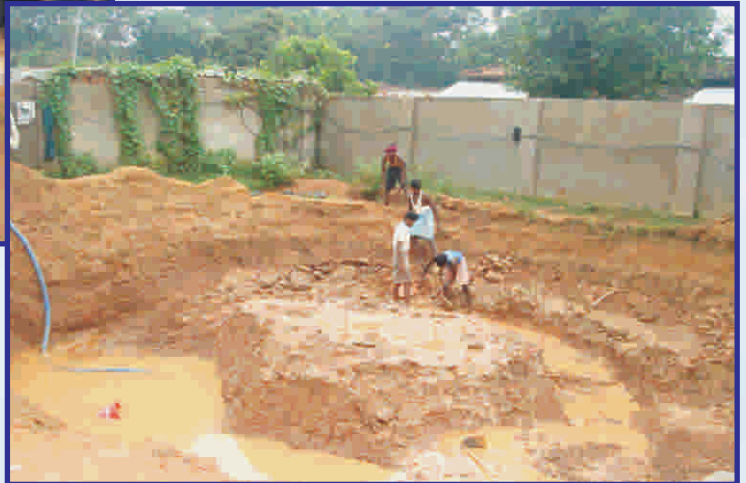
Work in progress for Overhead Water Tank