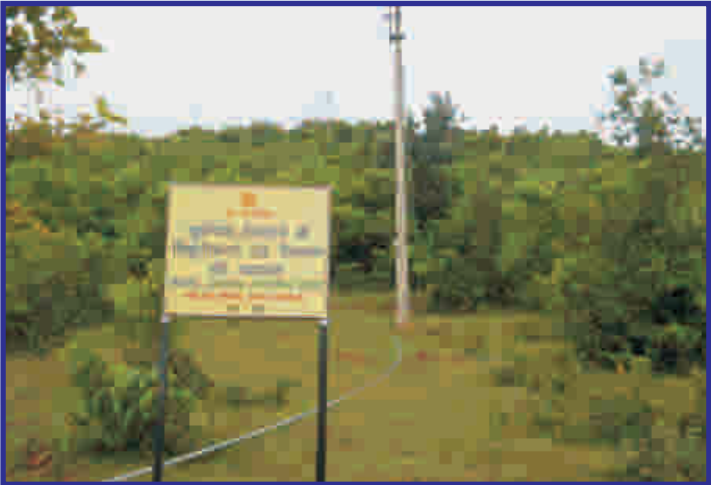
Providing lighting and water facility at Kurupat Temple