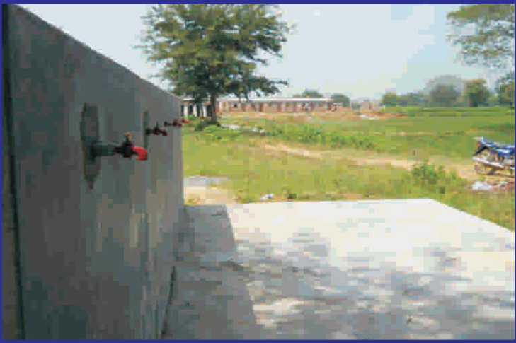
Construction of platform with taps for drinking water and bath.