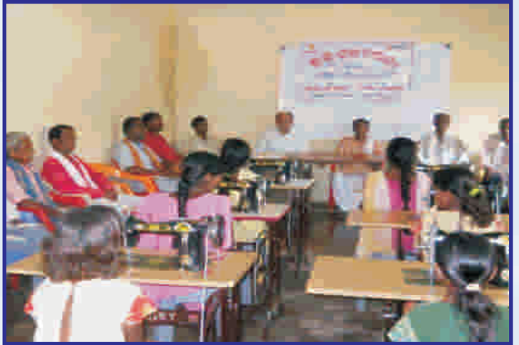
Tailoring training centre has been set up at Tundri