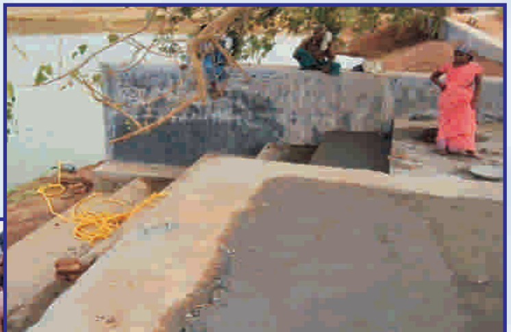
Bathing platform & staircase