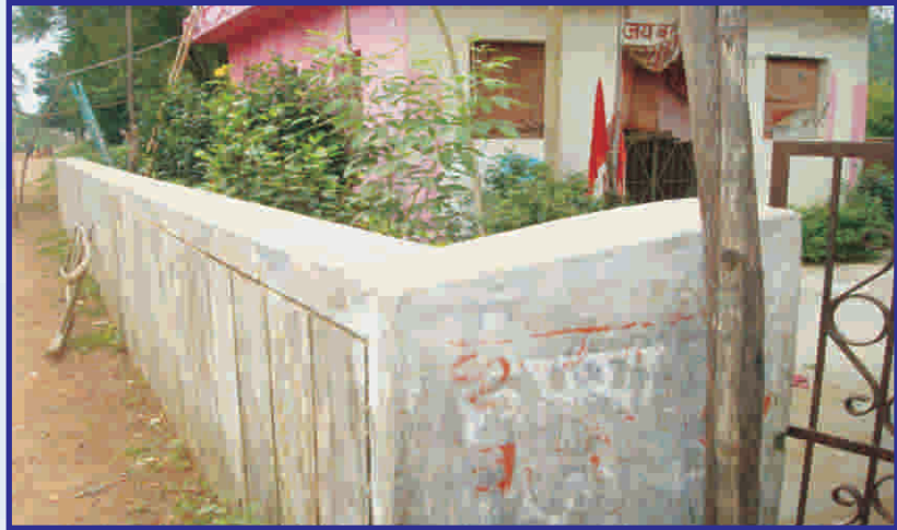
Boundary wall of village temple