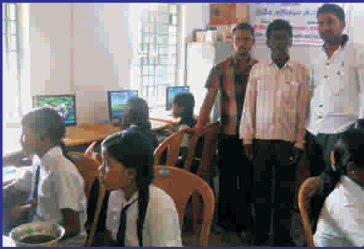
Computer centre has been setup at Badadhara