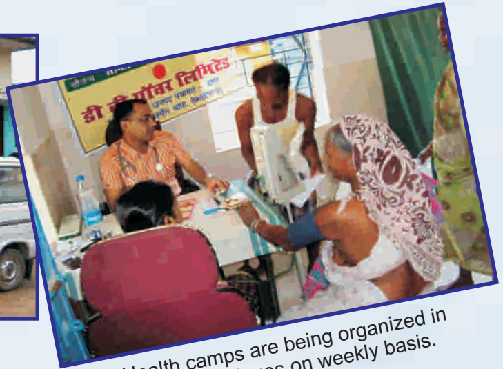
Health camps are being organized in different villages on weekly basis.