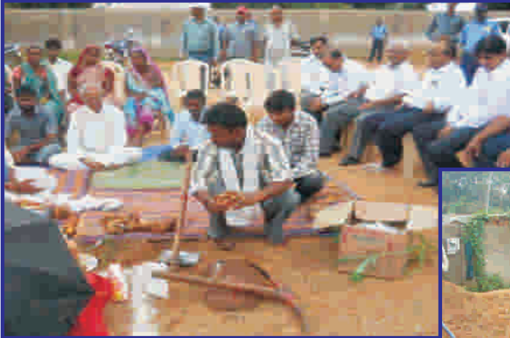
Bhumi Pujan for Overhead Water Tank