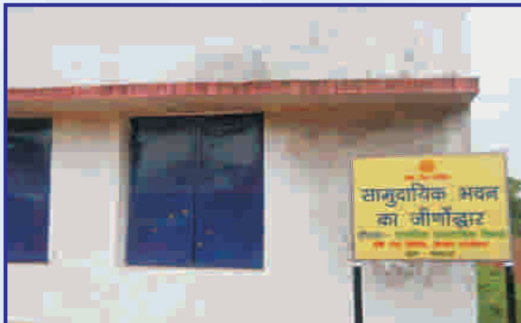
Community centre reconstruction