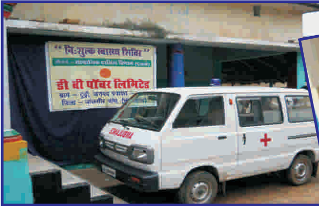
24 X 7 Ambulance service provided for emergency cases.