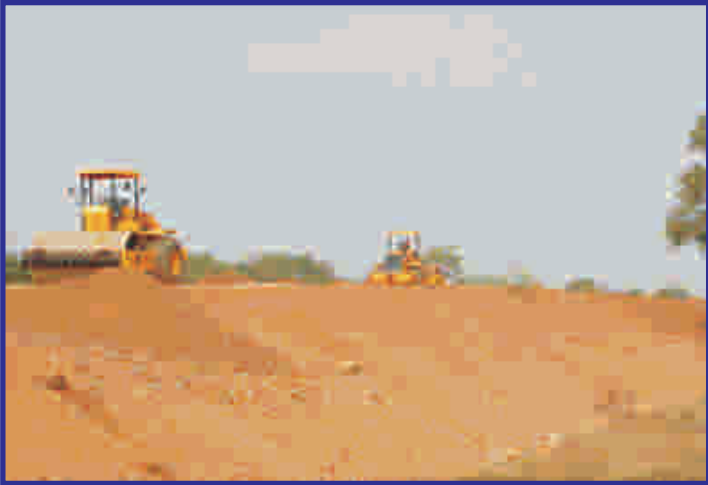
Construction of roads