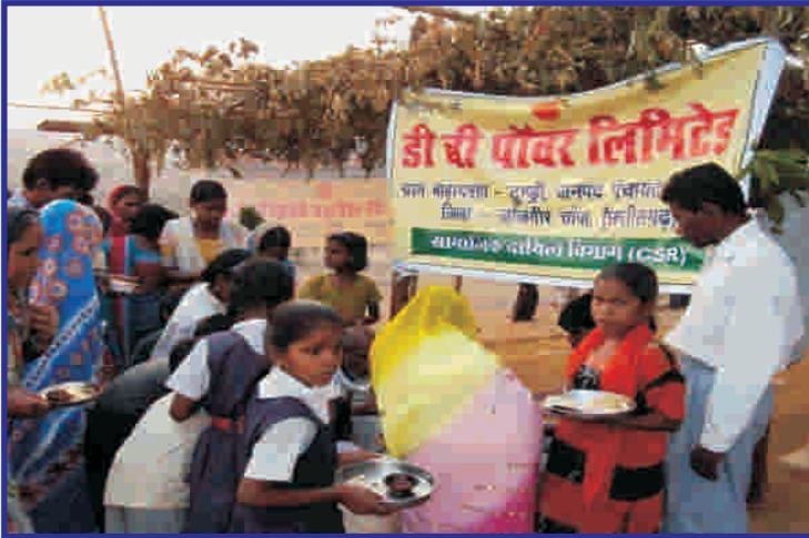
Kannya Bhoj & Prasad distribution