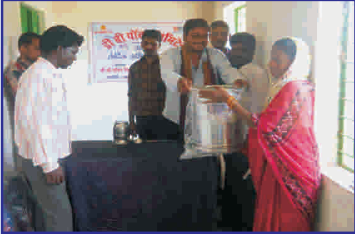
Utensils were donated to Anganwadi Centres in different villages.