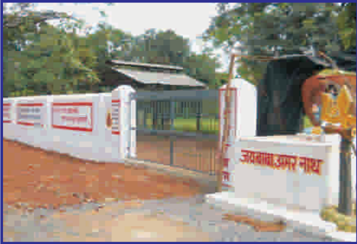
Development of Cremation Ground