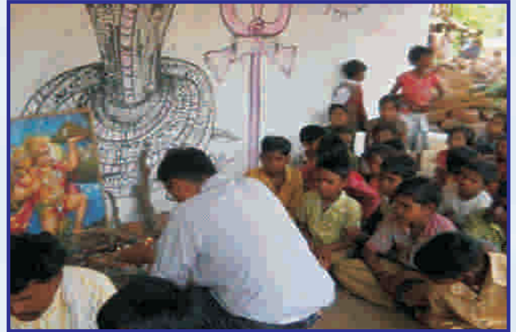
Nag Panchami festival

Almost all social & religious functions are supported by way of providing financial support.