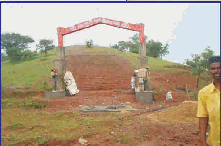
Construction of stairs at Kurupat Temple