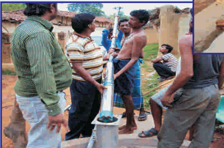
Bore well installation