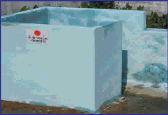
Construction of ladies bathrooms