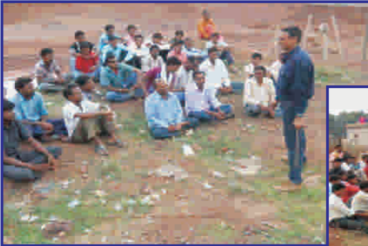
[Meeting with villagers]